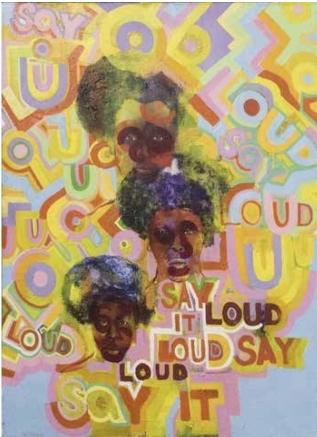
Say It Loud , 1969, Acrylic on canvas, 34 x 26 x 2 in.

F ifty years ago, the south side of Chicago cradled what arguably became the most influential black art collective of the 20th Century: AfriCOBRA, or the African Commune of Bad Relevant Artists. Even if you have never heard of this group, you have seen echoes of their aesthetic legacy. Over the course of a turbulent decade, from 1967 through 1977, their work traveled the United States in a series of landmark exhibitions that established what many scholars consider the definitive visual articulation of the Black Arts Movement.