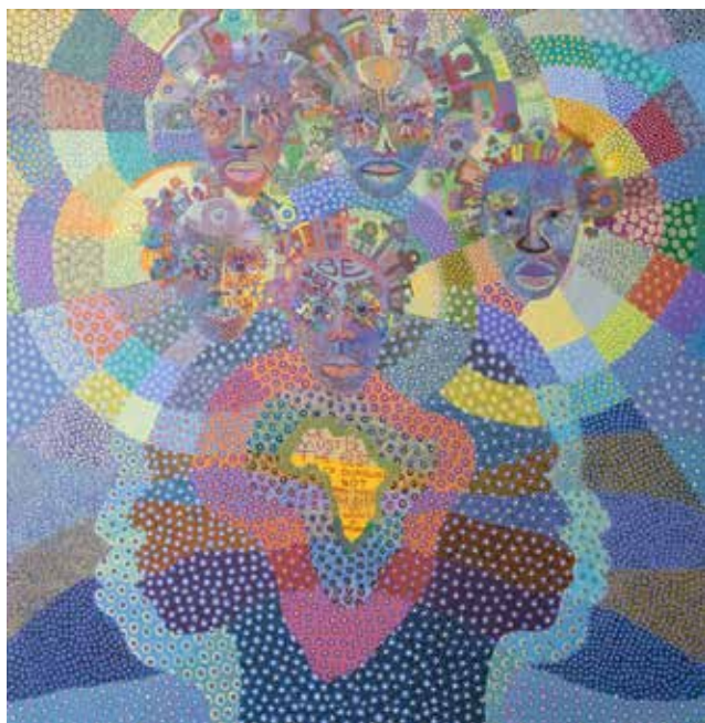
Message from a Giant , Acrylic on canvas, 47 1/2 × 47 1/2 × 2 in.